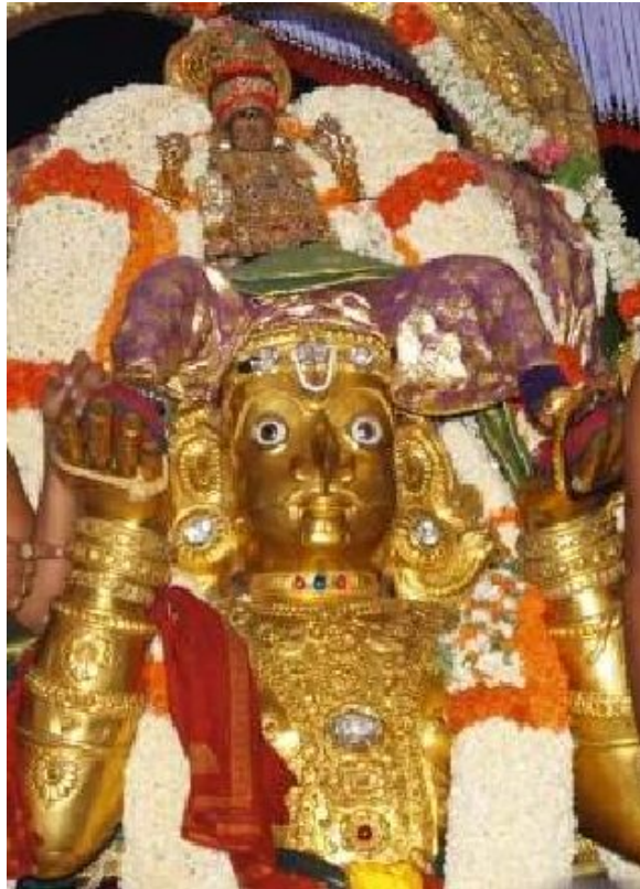
“ Kanchi Garudan”

The poetic genius of Swami Desikan is abundantly evident in this Composition. The Paadas of this Dhandakam parsed by its 144 GaNaas make intricate swoops in the air and make sharp turns like the high soaring Pakshi Raja (Garuda). The grammar of the flight movement of this Dhandakam is defined by NagaNaas and RagaNaas. At the beginning of each Paada, the first two GaNaas are made up of NagaNaas and the remaining 34 are made up of RagaNaas. NagaNaas are those GaNas or triads of Aksharas/Syllables, which are laghu in character; RagaNaas are those, where the middle Akshara is Laghu and the remaining two are Guru. The genius of Swami Desikan as a poet is revealed from the study of this Dhandakam, where he scrupulously adheres to the rules of the Dhandakam construction, including the nuances of meter and GaNaas constituting them.