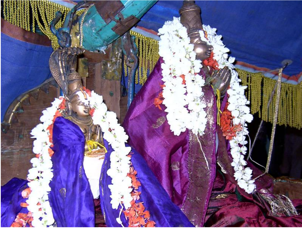
“Sri ananthan & Sri Garudan – Thiruvallikkeni”