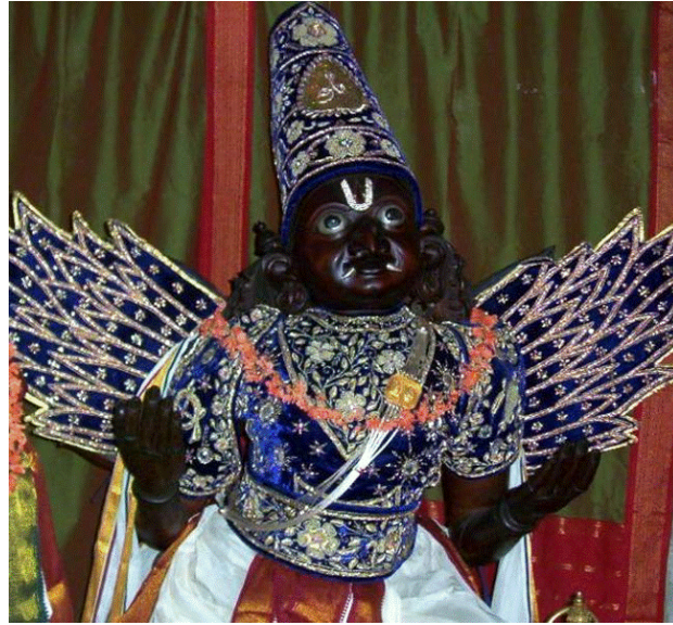
“Bindignavile Garudan ”

A frightening sound heard as "Bhaam" reverberates around the world at that time. The mighty elephants guarding the quarters are shaken up by this mighty sound of "Bhaam" and run to attack you, the generator of that sound. Your rows of sharp nails acting as the elephant goad attack those angry elephants of the quarters and repulse them. Your mighty beak raises terror in the minds of your enemies. When you knot your brows, it looks like the movement of the hood of a Cobra. Your canine teeth look like the Vajra weapon of Indra and strikes terror in the hearts of your enemies. My salutations to you of such limitless glory! May thou bless me so that Brahma Vidyas become easy to be possessed by me! Please bless me out of your infinite compassion so that I can have the good fortune to offer kankaryams to you.