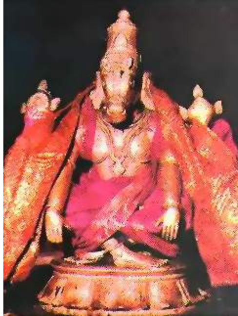
Sri Yogaasika Hayagriva

All the achievements of Swami Desikan as a Great Acharya arose from the blessings conferred by Both Garuda Bhagavaan and His Lord Sri Hayagreevan at Thiruvahindrapuram. The archa murthy of the Yogaasika Hayagreeva presented by Garuda Bhagavaan can be seen even today, next to the Vighraha of Swami Desikan sculpted by his own hands, when he was challenged by a sculptor, who wanted to defeat Swami in a vighraha nirmAnam contest.