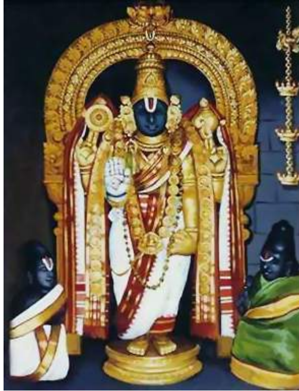
Sri Devanayaka Perumal

After his Acharya's passing away, Sri Desikan settled at Thiruvahindrapuram and