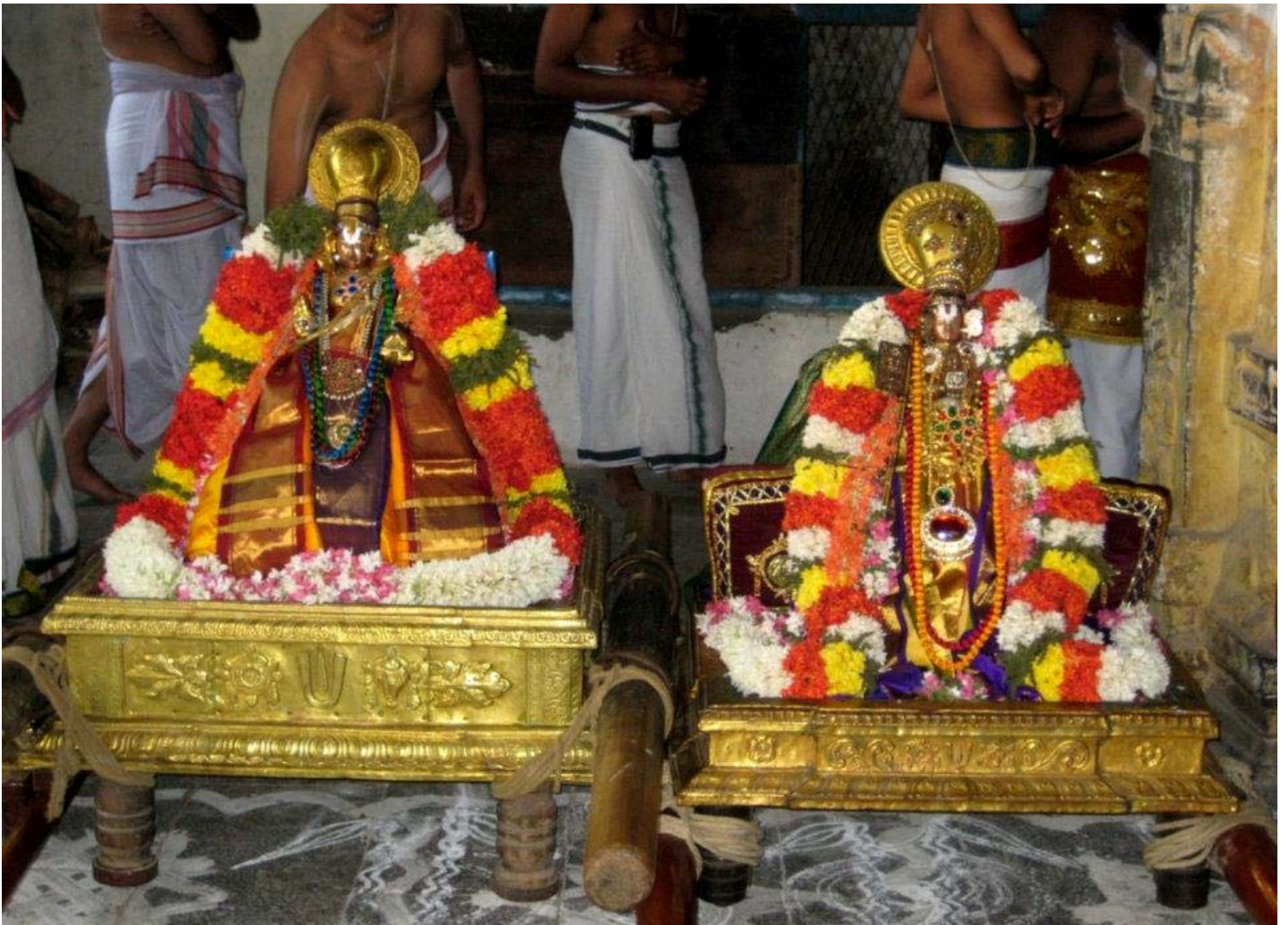
Swami Vedanta Desikan and Sri Manavala Mamunikal - Kanchipuram

His two alternative interpretations of Gita [18-66] do not state explicitly that 'surrender' is an alternative path to salvation as against the path of 'devotion'. But in these interpretations there is a clear hint of his concept of surrender, which is elaborated in the Gadyas. In the first interpretation of the Charama sloka [18-66], he takes all dharmas to mean the paths of karma yoga, jnana yoga and bhakti yoga - these disciplines are not to be given up but to be performed as a worship pleasing to God; what is to be given up is the karmic fruit of such actions, the notion that the actions are one's own, the idea that one is the author of these actions. This would mean that God is the sole performer, the sole refuge; He is both the means and the goal; worshipping Him in this spirit, would ensure the deliverance of the devotee from all the accumulated sins which upto now barred him from realization, as assured in the second part of the sloka. In the second interpretation, the dharmas to be given up are the expiatory ceremonies to remove the sins that obstruct bhakti yoga; the sins are infinite, the ceremonies are countless, life is short - and so Arjuna is advised to surrender unto Him, who will wipe away the sins that prevent him from practising bhakti yoga.