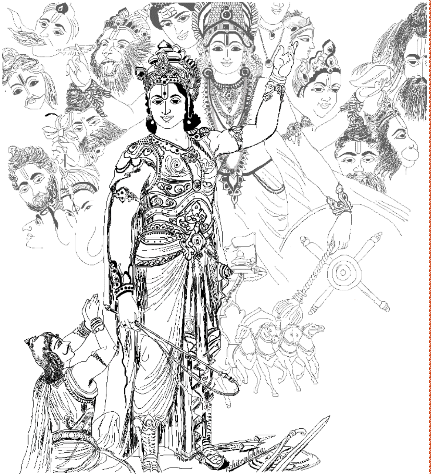
"The Lord's words on the battlefield of Kurukshetra" Hitopadesam