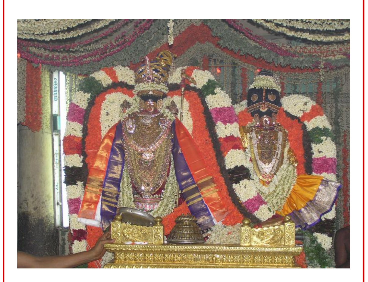
Leela yashtim kara kisalayoH

liilaayaShTiM kara kisalaye daxiNe nyasya dhanyaam.h aMse devyaaH pulaka ruchire sanniviShTaanya baahuH. megha shyaamo jayati lalito mekhalaa datta veNuH ku~njaapiiDa sphurita chikuro gopakanyaa bhuja~NgaH..18