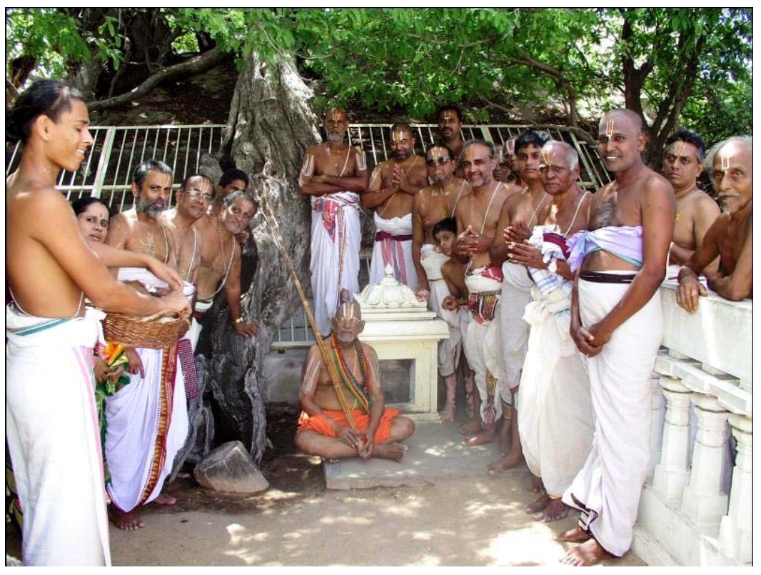
HH prakrtam SrImad azhagiya singar with sishyAs under the tiruppuLiyAzhwAr tirukkurukUr