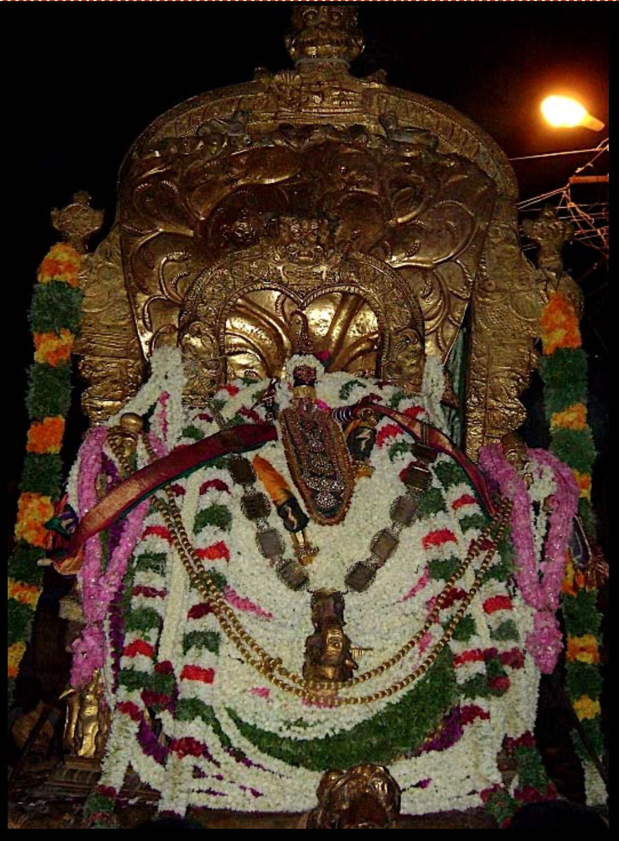
Swami nammAzhwAr in tiruppuLiyAzhwAr vAhanam AzhwAr tirunagari