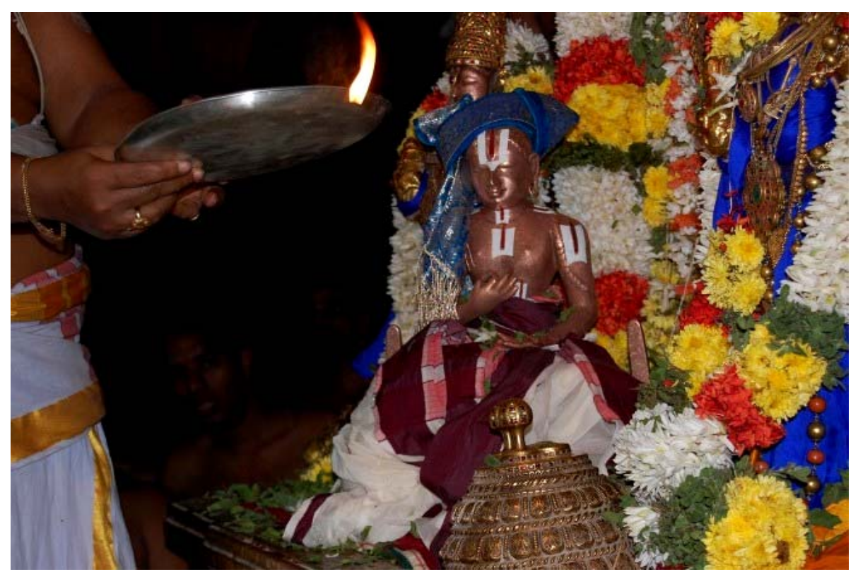
swami nammAzhwAr at SrI varadar's tiruvaDi after mokshAnugraham tirukkacchi