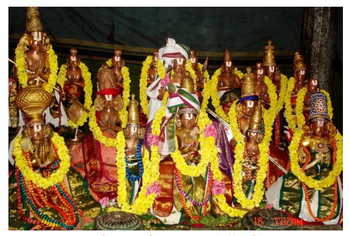
AzhwAr-s and AcAryA-s at tirukkacchi

tanmai Akkil - in blessing the jIvan with many qualities similar to His (above ten being the anugrahams of the Lord for the jIvan)