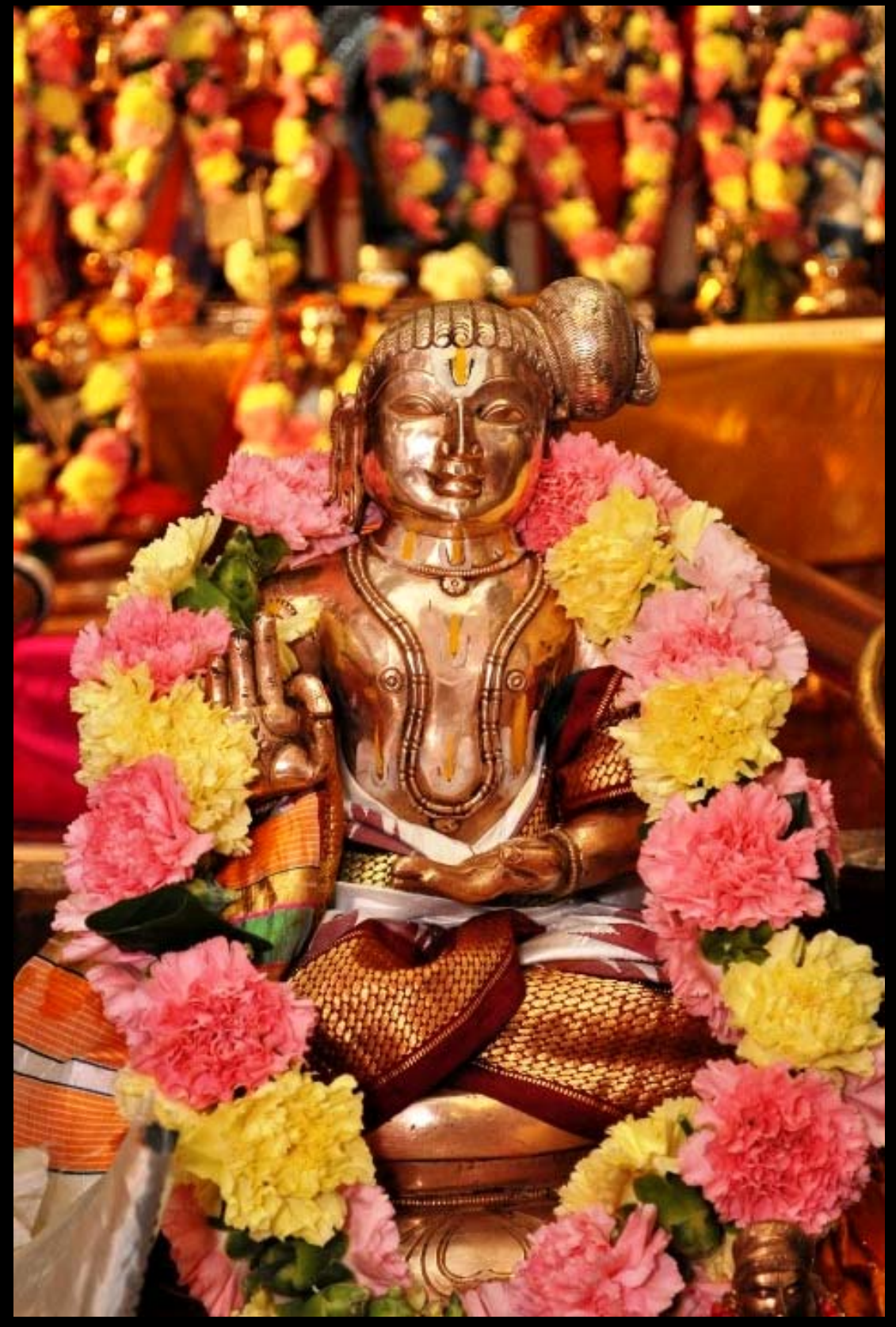
SwAmi\ nammAzhwAr\ \ (Thanks:\ www.ranganatha.org)