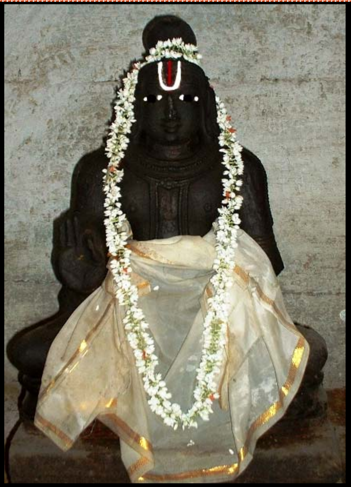
Swami NammAzhwAr - Satyagalam