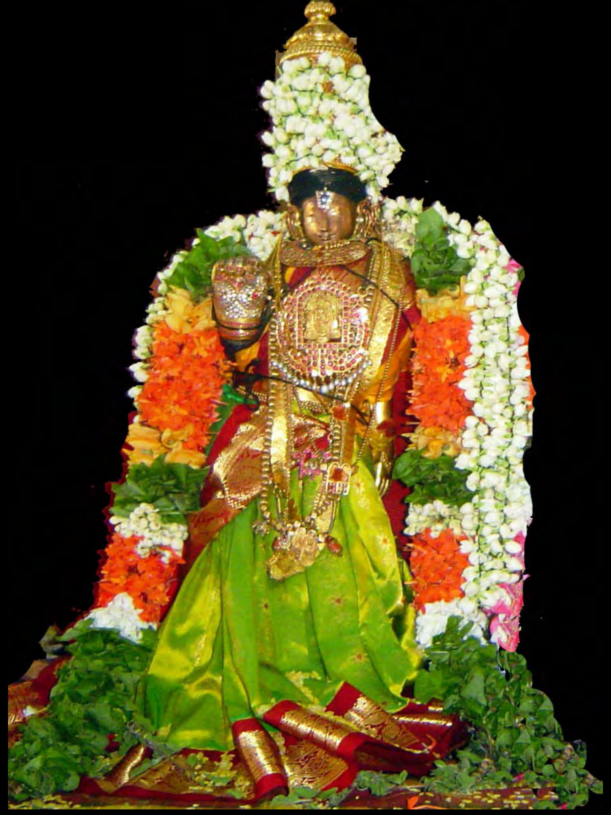
kshamA putri - SrI bhUmidevi tAyAr, tiruviNNagaram