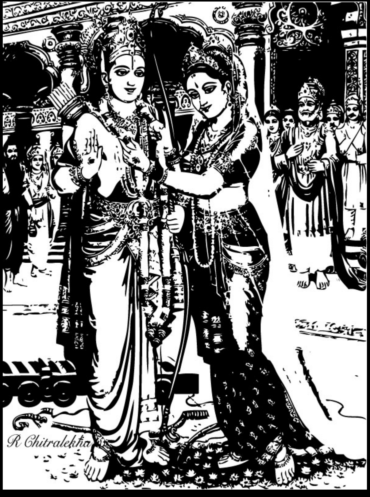
Swayamvaram of SitA