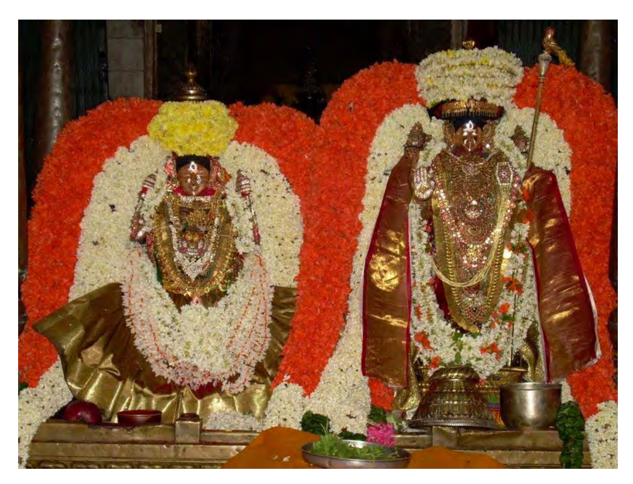
kapyAsam puNDarIkam - tiruvendipuram divya dampatis

that Rama slept on the darbha grass while waiting for a response from the Samudra rAjan. The poet twists the sound of the word to mean that Rama attained kuSeSayam or the quality of lotus of being the residence of PirATTi.