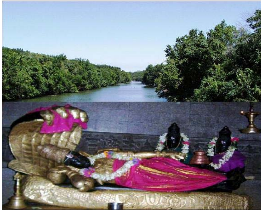
VegA Sethu PerumAL

7. There will be no YathOkthakAri PerumAL, VegA Sethu SthOthram or Kanchi VaradarAjan incarnating as the phalan of Brahma's Yajnam without Sarasvathi.