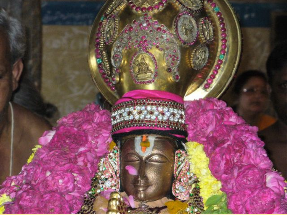
Swami Desikan on His Thirunakshatram at Thiruvaheendrapuram