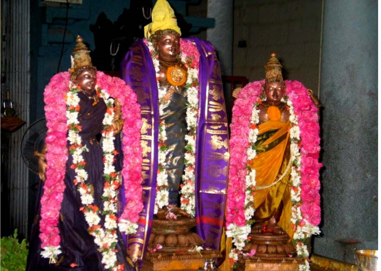
"The paripUrNan with svarNamaya tirumeni!"

vAlmIkir-vivrNoti shoDaSavidhApraSnena te vaibhavam pUrNam nAradabhAshitam vidhivaSAAt labdhottarANyanjasA | tat rAmAayaNam adbhutam vijayate sauvarNam atyujvalam yasmAt shoDaSavarNavasan vilasati tvam sarvadA rAghava ||