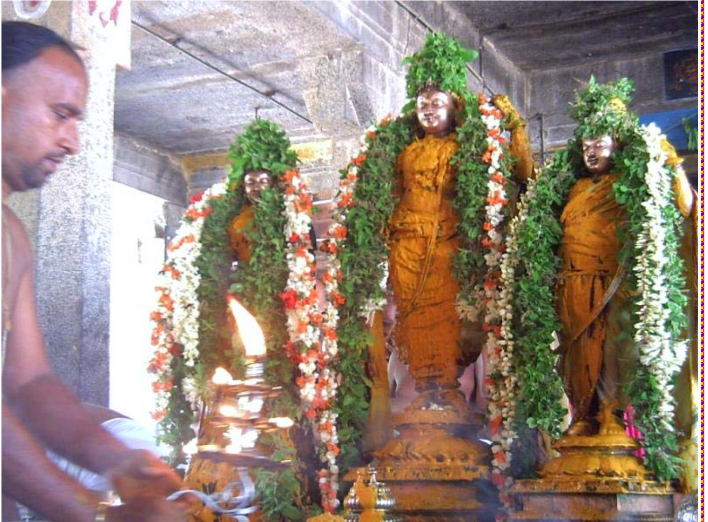
'nIrAjanam to SrI KodaNDarAman!'

tadbhUtyA parikalpitam vilasatu stotra sunirAjanam ||