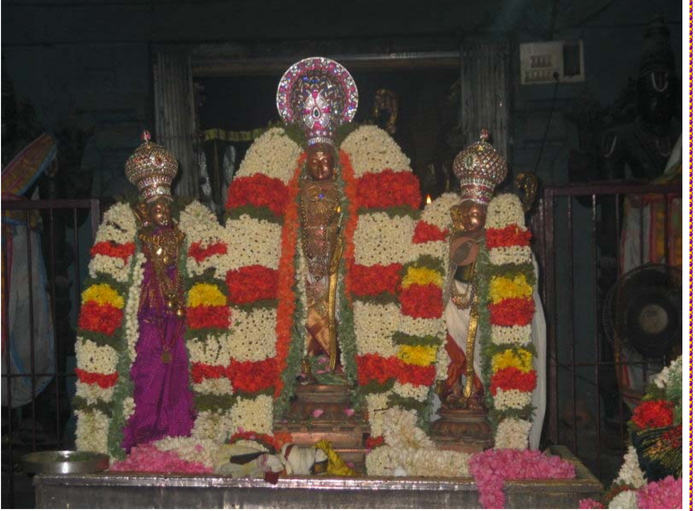
"The Lord of MadhurAntakam!"

(SishTA-s). Only they can describe precisely and at length Your vaibhavam. As for myself, aDiyEn has immovable aj~nAnam. When aDiyEn myself knows about this, it is futile to assume that others do not know about my ignorance. In spite of this handicap, Your glances push me forward to engage in creating these tributes. I am rambling along. Please do not look too deep into my salutations with a critical eye. Please treat them as a simpleton's offerings and accept them with a mind full of karuNai!