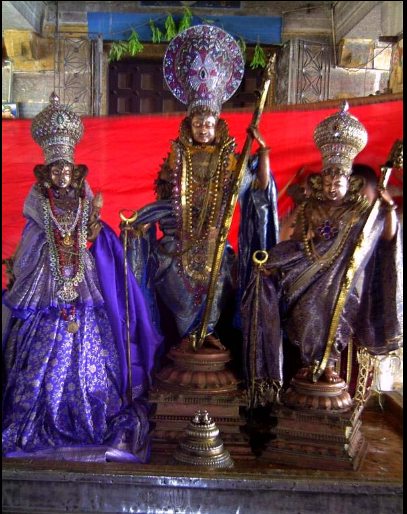
aDiyEn bows to the Lord with the kodaNDam in His hand - MadhurAntakam SrI rAma pariva-