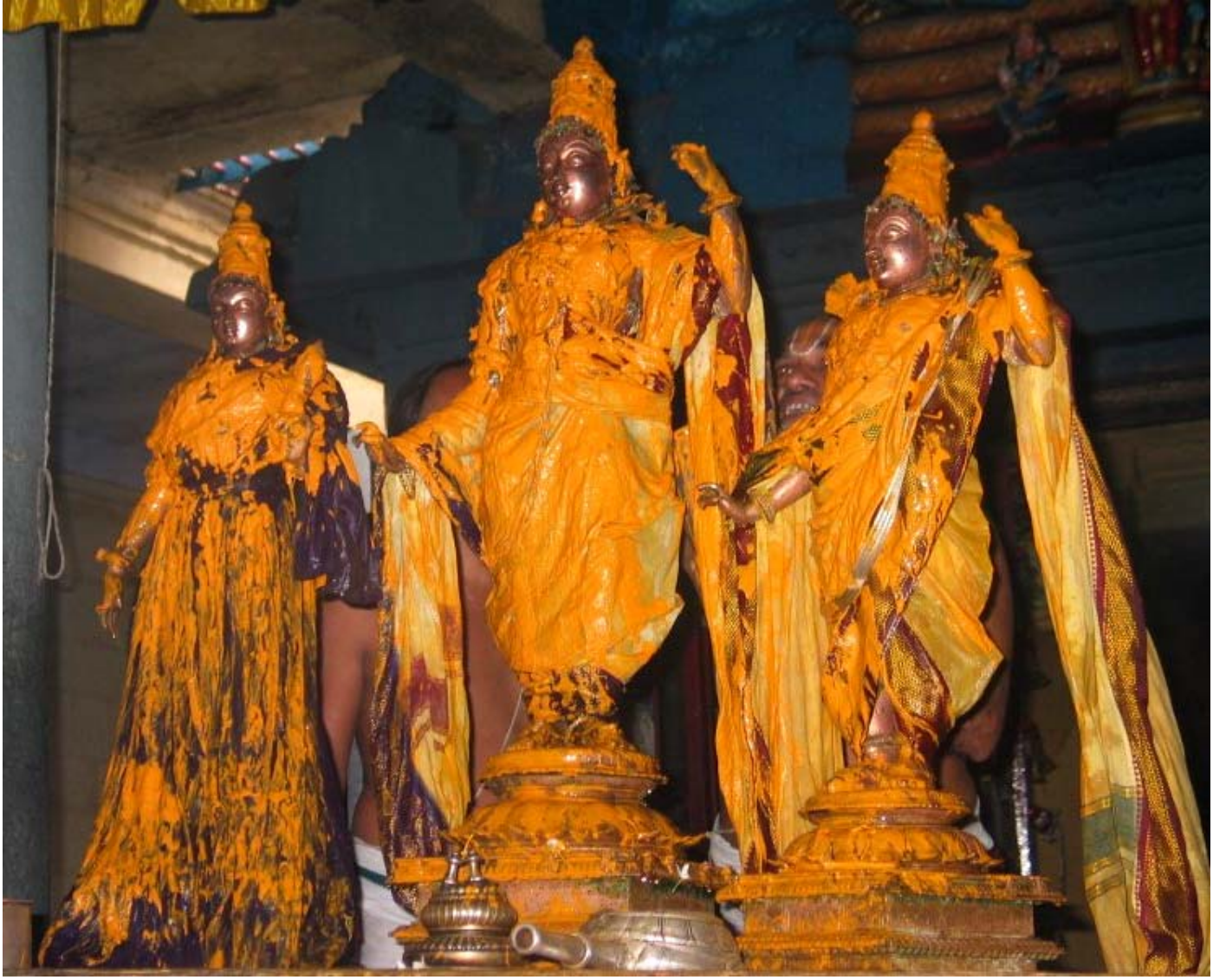
The Lord Who sanctifies the World with His kaTAKsham!