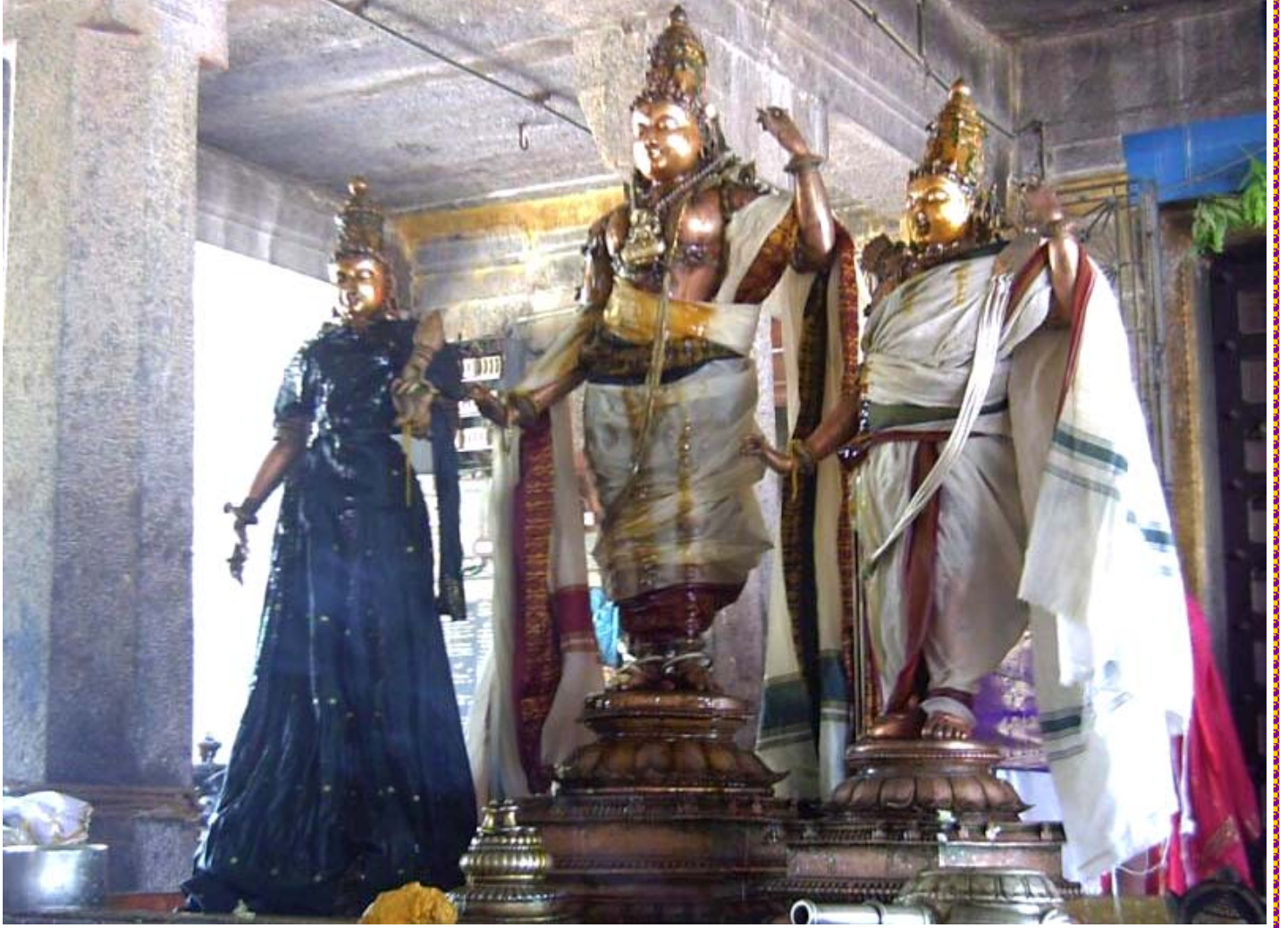
'Parama kAruNya mUrtil!' - SrI rAma parivAram - MadhurAntakam

every day and aDiyEn will bow before this lofty KodaNDam often ( ucchrAyam paramam prapadya sakalAn AkarshayatyAnvaham ). It showers its KaruNai on every one by protecting them ( tam seve karuNAkaram muhuraHam SARngAvatAram param ); KodaNDam is the altered form of SrI VaikuNThanAthAn's SARngam at SrI VaikuNTham and aDiyEn will bow before the embodiment of the KaruNai of the Lord often ( tam seve karuNAkaram muhuraHam SARngAvatAram param ).