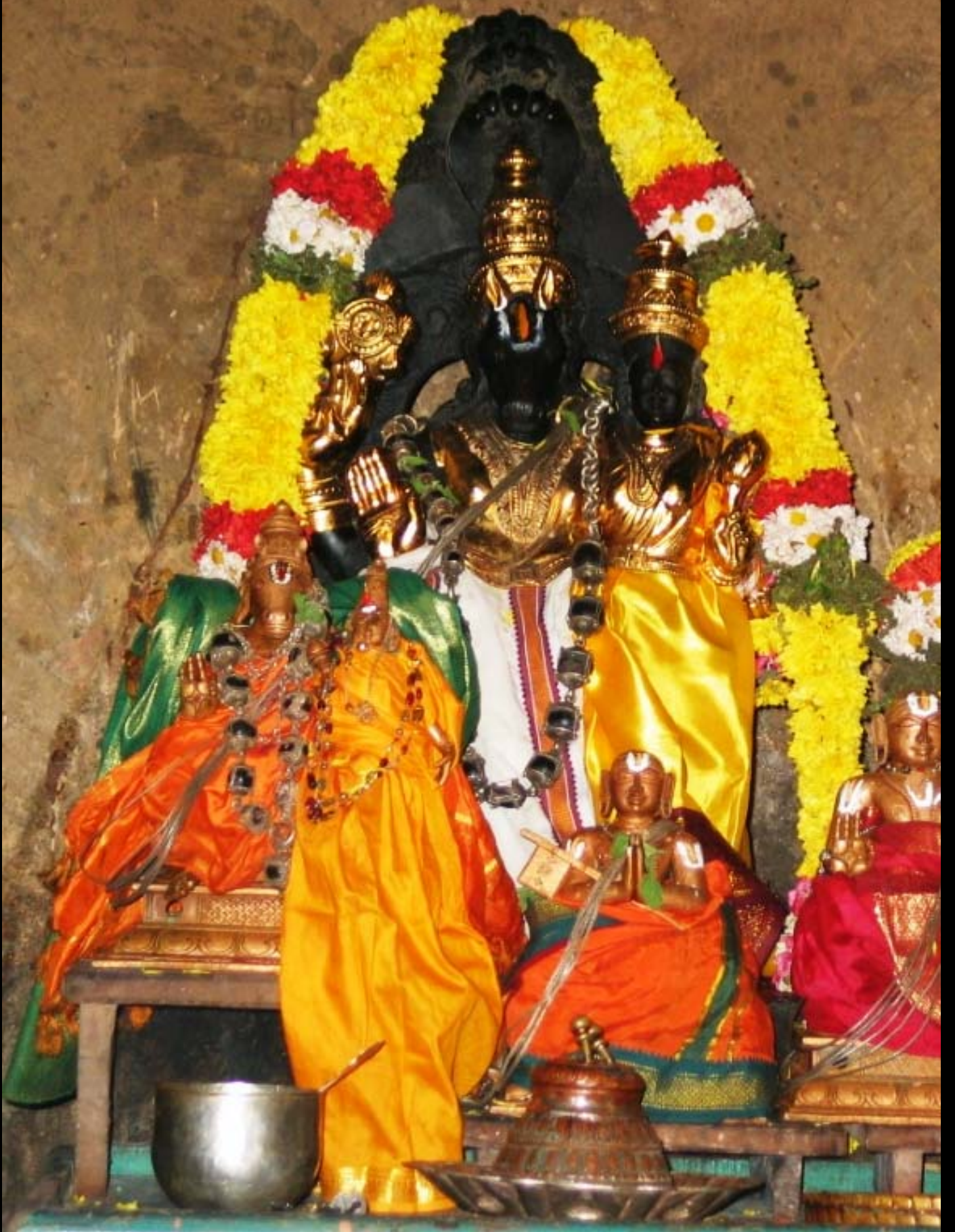
"SrI Lakshmi sitting on the lap of bhagavan bless aDiyEn's vAk!" SrI lakshmiHayagrIvar- SrI parakAla maTham, tUppul