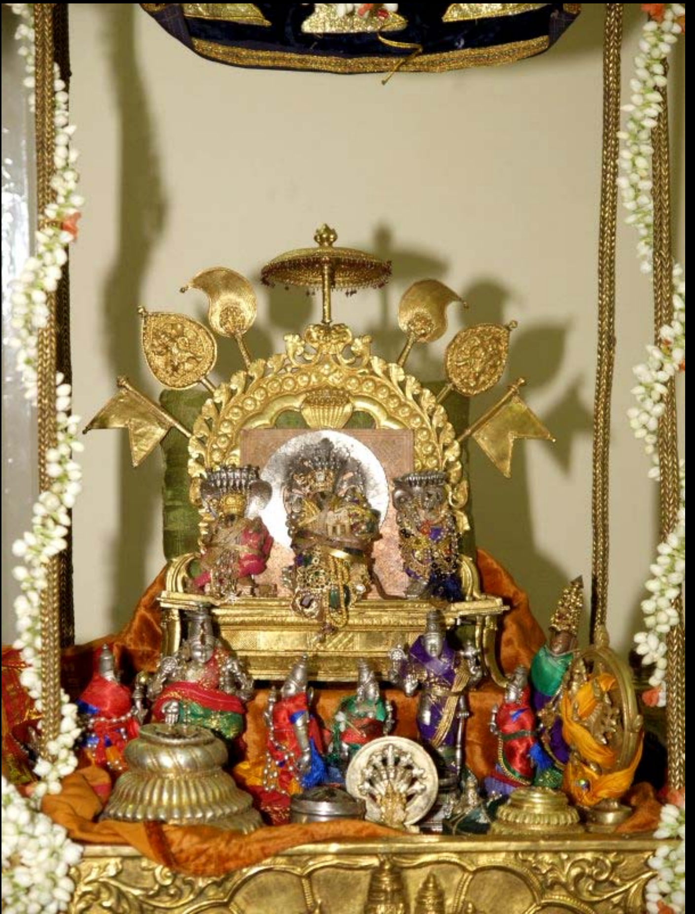
SrI lakshmihayagrIvar Dolai - SrImad ParakAla maTham, Mysore