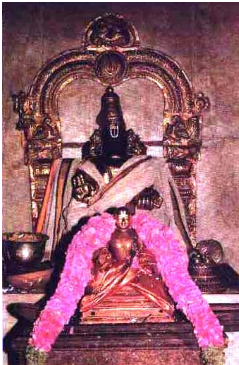
Swami Desikan - Thiruvaheendrapuram