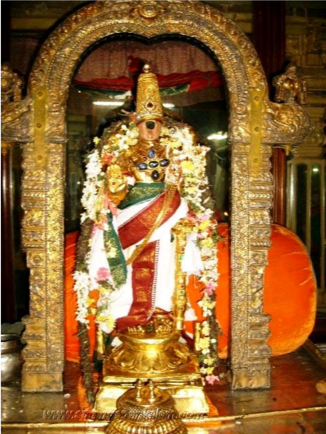
ashtAksharan - namperumAl - SrIrangam